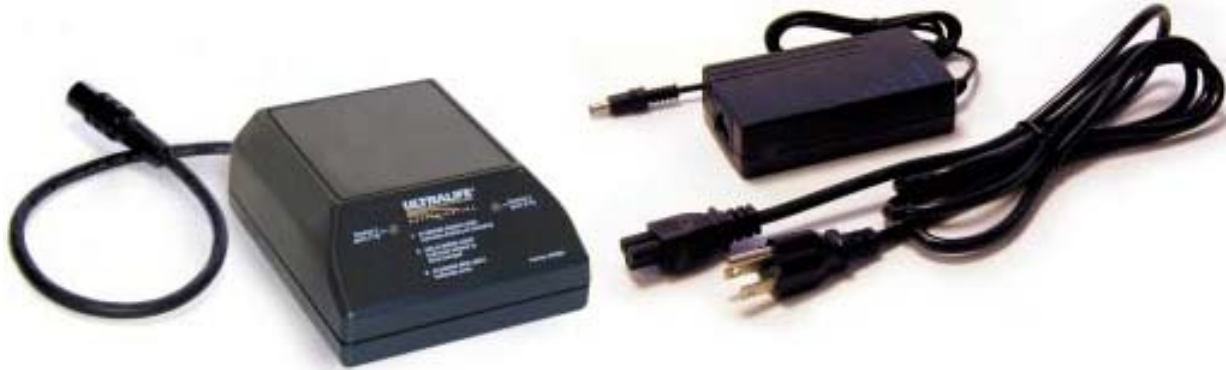
CH0014 commercial desktop charger for UBBL09 battery

Better technology. Our battery & charging technologies and power systems enable us to design leading-edge solutions for the world's most demanding applications.