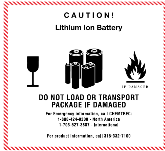
Label for use with excepted lithium ion and lithium ion polymer cells or batteries

* Labels not shown with actual dimensions