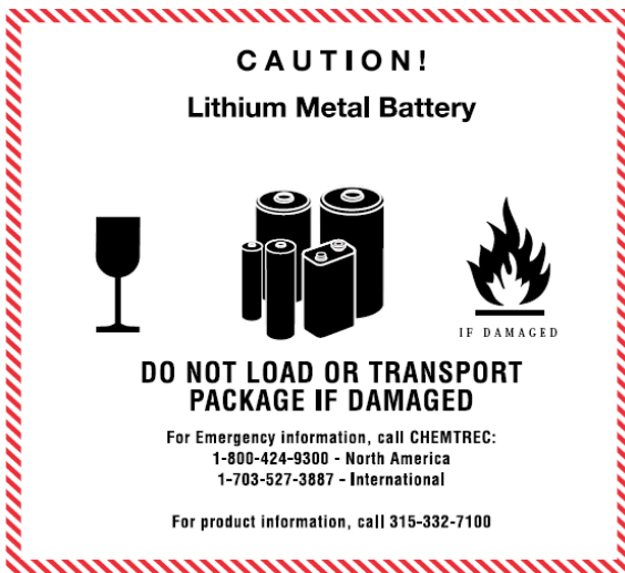
Label for use with excepted lithium metal cells or batteries